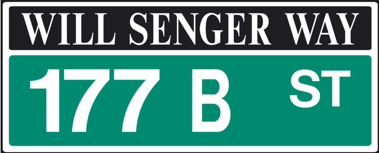
Sample of the Will Senger Way Commemorative Sign