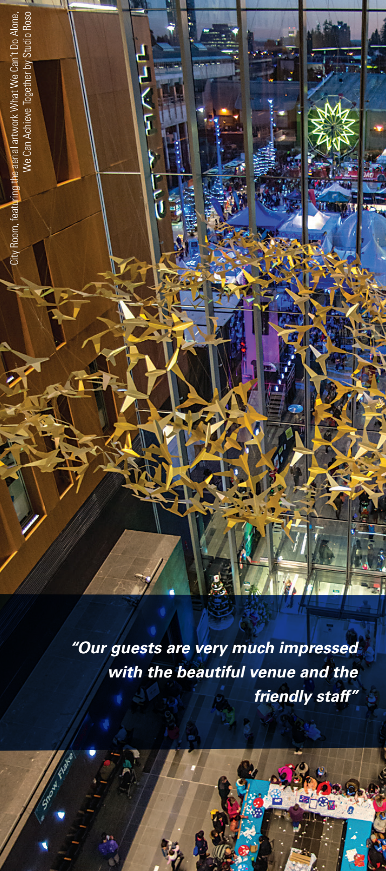
City Room, featuring the aerial artwork What We Can't Do Alone, We Can Achieve Together by Studio Roso

"Our guests are very much impressed with the beautiful venue and the friendly staff"