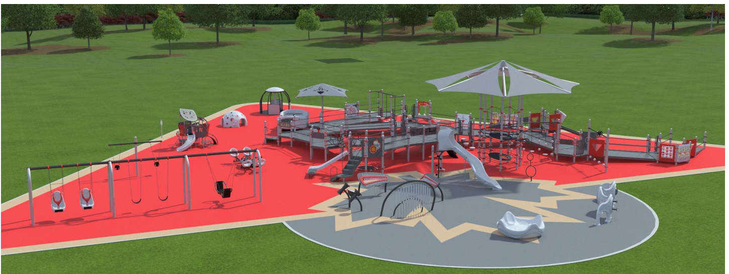
Jumpstart Playground Unwin Park Surrey, BC

Jumpstart's vision is to create a Canada where all kids can achieve their dreams through access to sport and play. For more information about Jumpstart's Inclusive Play Project, please visit jumpstart.canadiantire.ca .