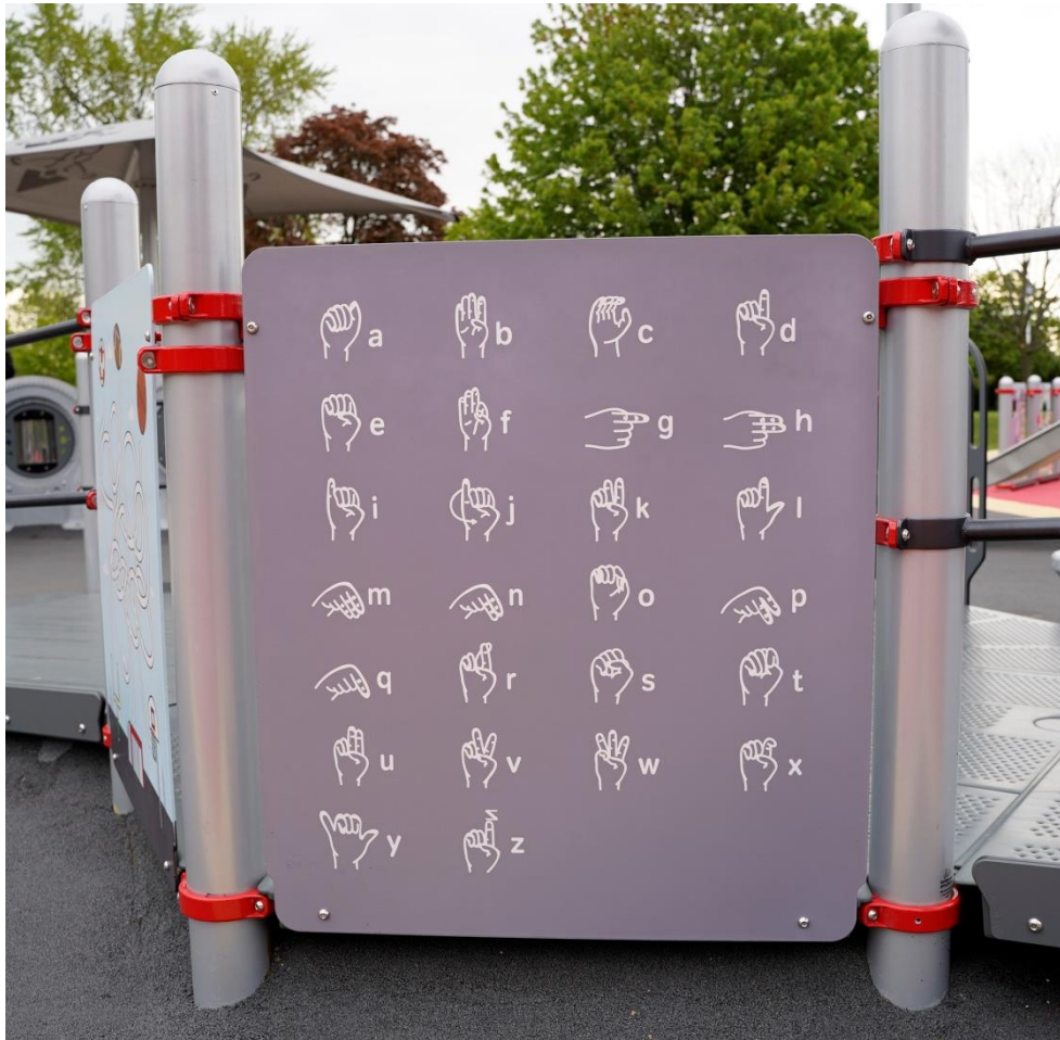
Sign Language Panel

The Sign Language Panel enables children to explore a different way of communicating with each other. The images allow children to practice Sign Language with their new friends who might use this language as their primary way of communicating.