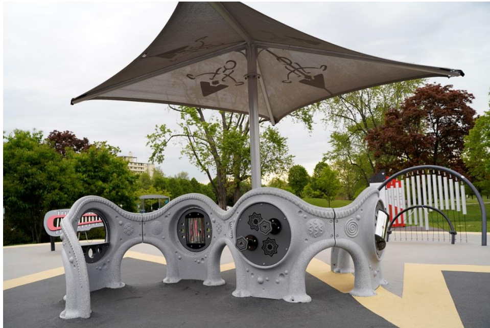
Sensory Play Center

The following play elements support children's sensory needs while they play.