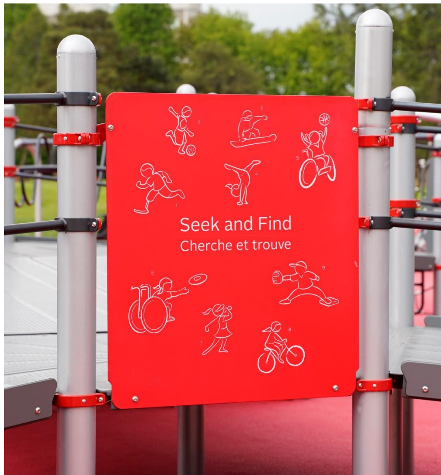
Seek and Find Panel

The Seek and Find Panel has a variety of the different Jumpstart Action Icons that are also scattered throughout the playground. Children can cooperatively or competitively work their way around the playground to find the assorted icons with their friends.