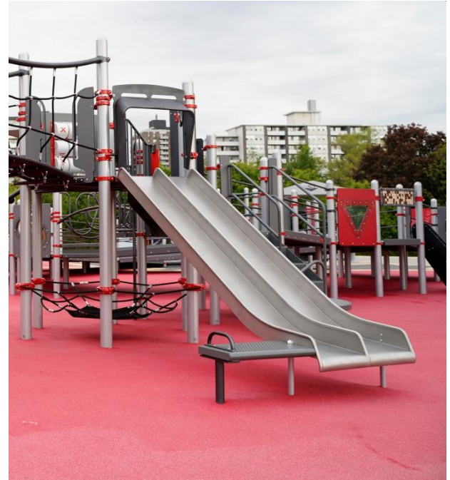
Stainless Steel Double Slide with Transfer Bench