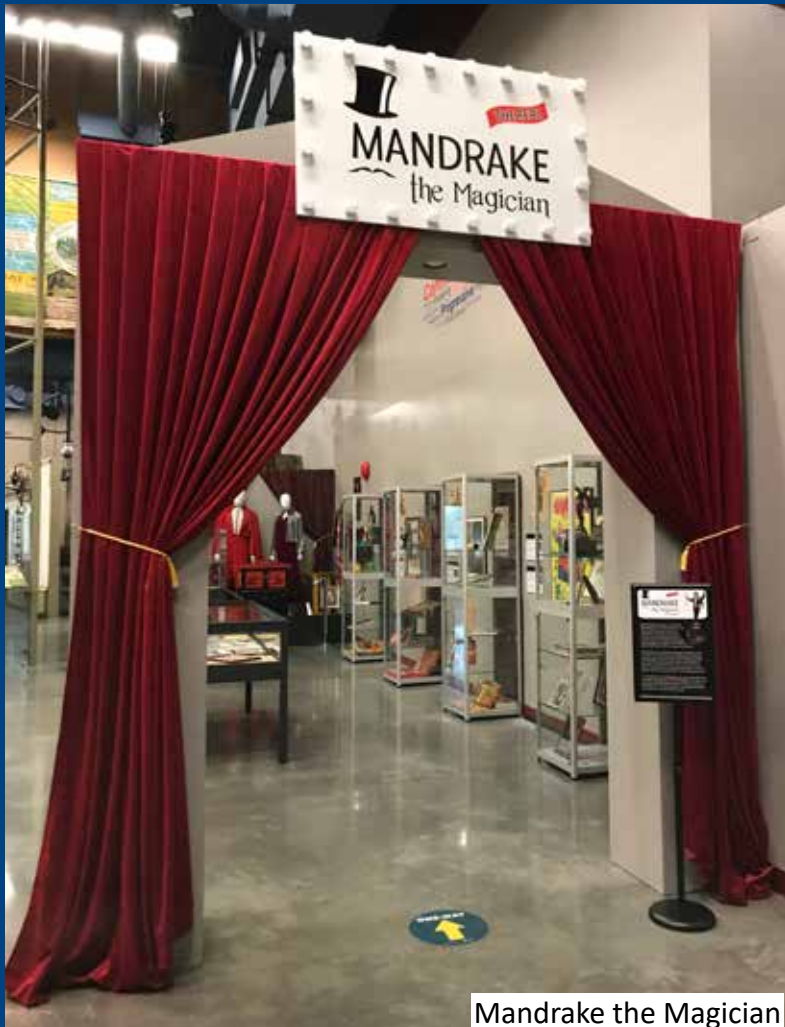
Mandrake the Magician