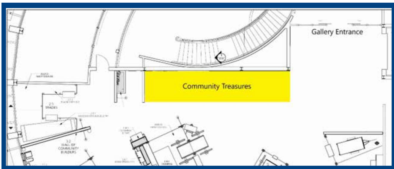
Surrey Stories Gallery

Exhibit cases, graphics and digital options like video will be discussed with the Assistant Curator as you plan the exhibit.