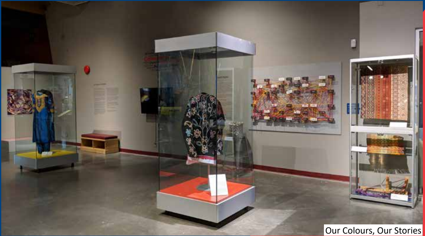
Our Colours, Our Stories