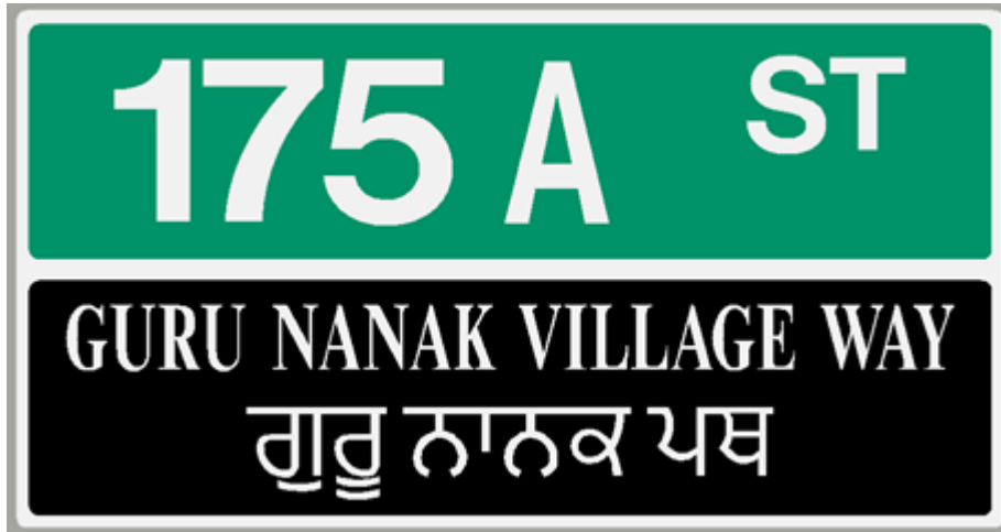
Sample of the Guru Nanak Village Way Commemorative Sign