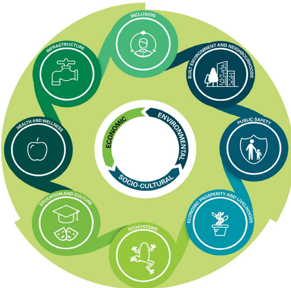
Figure 1: Sustainability Charter Structure

Goals within Surrey's Sustainability Charter are categorized according to eight overlapping community themes. Each theme has an overarching goal, followed by the Desired Outcomes the community wants to see looking ahead to the year 2058.