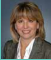
MAYOR DIANNE WATTS