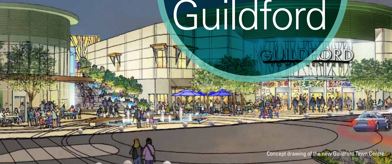
Concept drawing of the new Guildford Town Centre