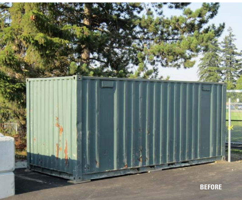
Anti-Graffiti Beautification Project - Cap Cemetery Yard Storage Bin

The RCMP launched the Business License Outreach Project in early 2010. In nine months, it engaged 689 new business license holders with support services such as security site assessments based on CPTED principles, communicating hot spot or crime trends and educational materials and workshops for employees.