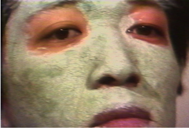
Still from 7 Day Activity , 1977.

space for us to sort through potentials and pitfalls of incessant media production and consumption. Flash Memory (2010-2015), a video installation and image chronology of Wong's everyday life (over 27,000 digital images played at 15 images per second) and #LLL Looking Listening Looping (2014)—350 GIFs, Vine videos, and Instagram clips presented on an array of small screens across a gallery wall—call attention to the sheer volume, and particularly how personal content is becoming increasingly public and shared. No longer censored by or excluded from mainstream media, these new waves of micro media—and the shift towards personal channels such as Facebook, Twitter, YouTube and Instagram—have created plural networks of interaction and, one would hope, more diverse representations of society. Media, in many ways, has caught up to his vision of what is possible. However, Wong warns that it's too early to draw conclusions about its full impact on art and contemporary life, particularly in dissolving the persistent hierarchies of representation: "We are very much in the early, primitive years of digital culture and its possibilities, the democratization of media and its expansion around creative, artistic endeavours: how it's made, how it's shared, how it is commodified, how it is distributed." 5