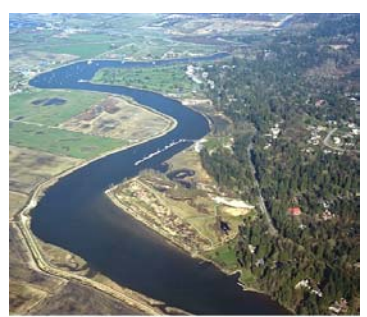
020 - Elgin Heritage Park