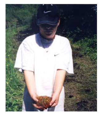
Relocating salamander eggs