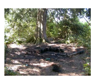
Illegal fire pit

In Surrey, of greatest concern is the large percentage of fires that are deliberately set in close proximity to facilities and structures adjacent to