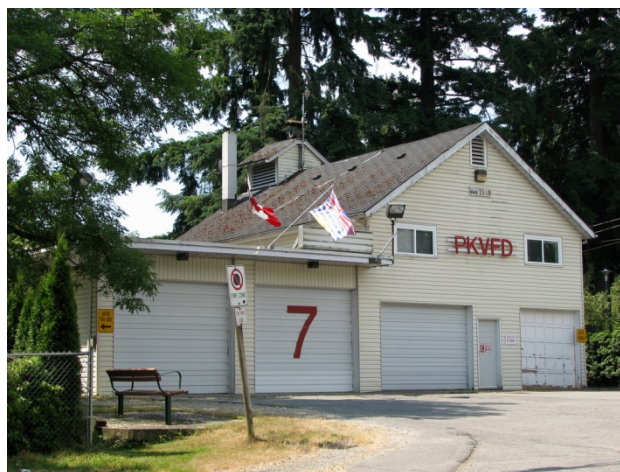
Port Kells Volunteer Fire Department