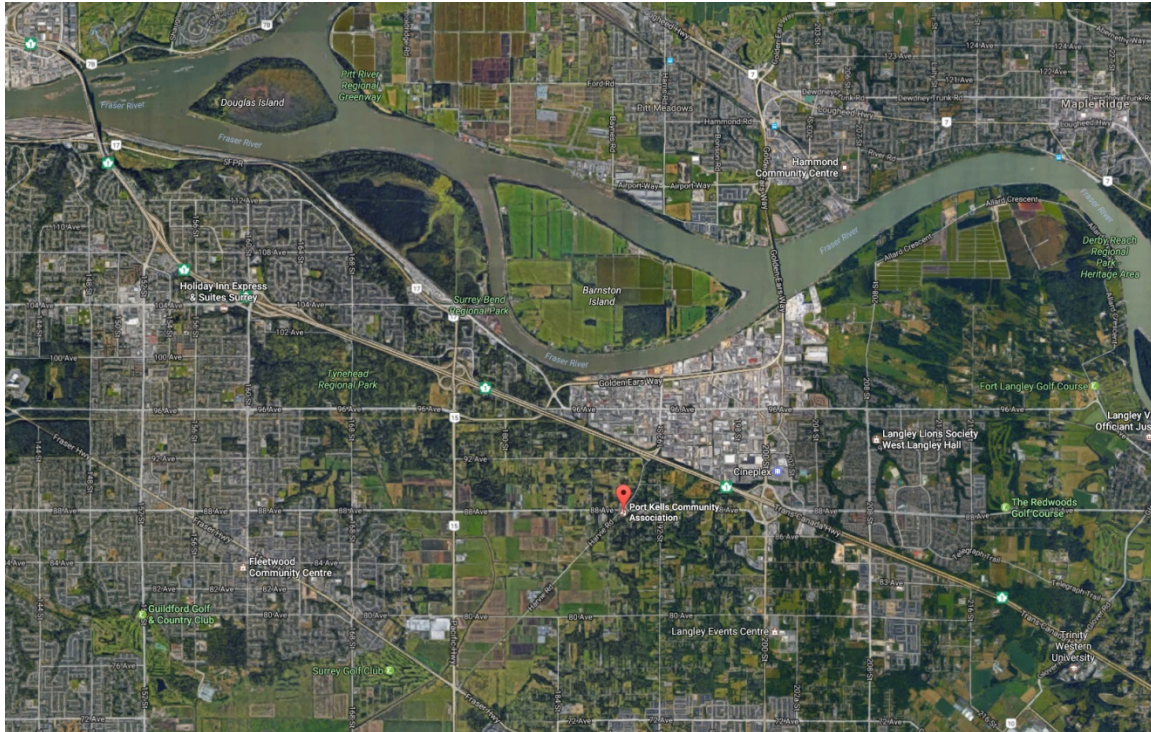
Aerial view of Port Kells and the relationships it has with the Fraser River, neighbouring Surrey districts, Township of Langley, Barnston Island, and the Cities of Maple Ridge and Pitt Meadows.