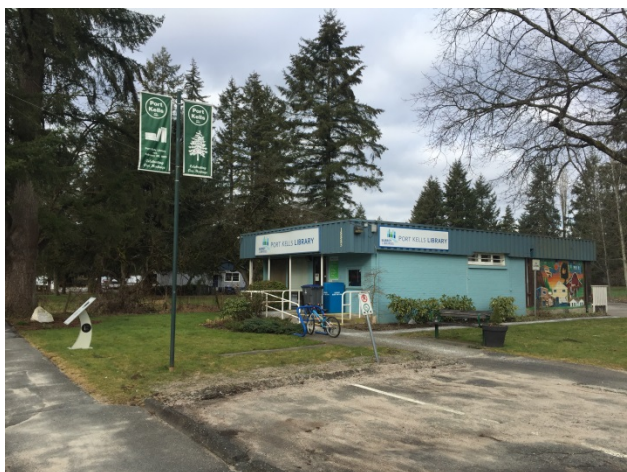
Port Kells Public Library