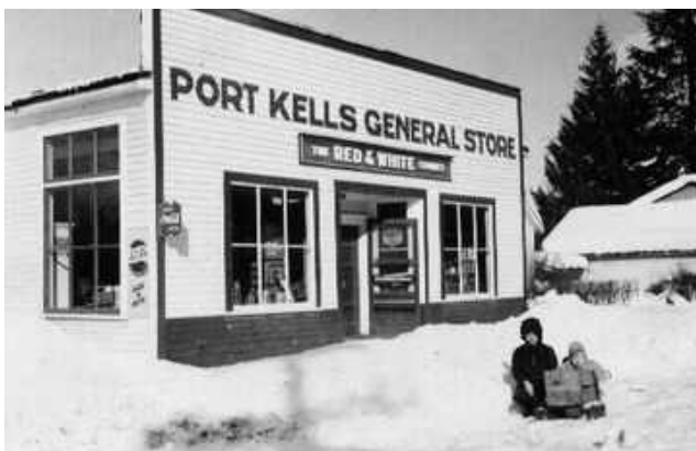
Port Kells General Store during heavy snow of 1951