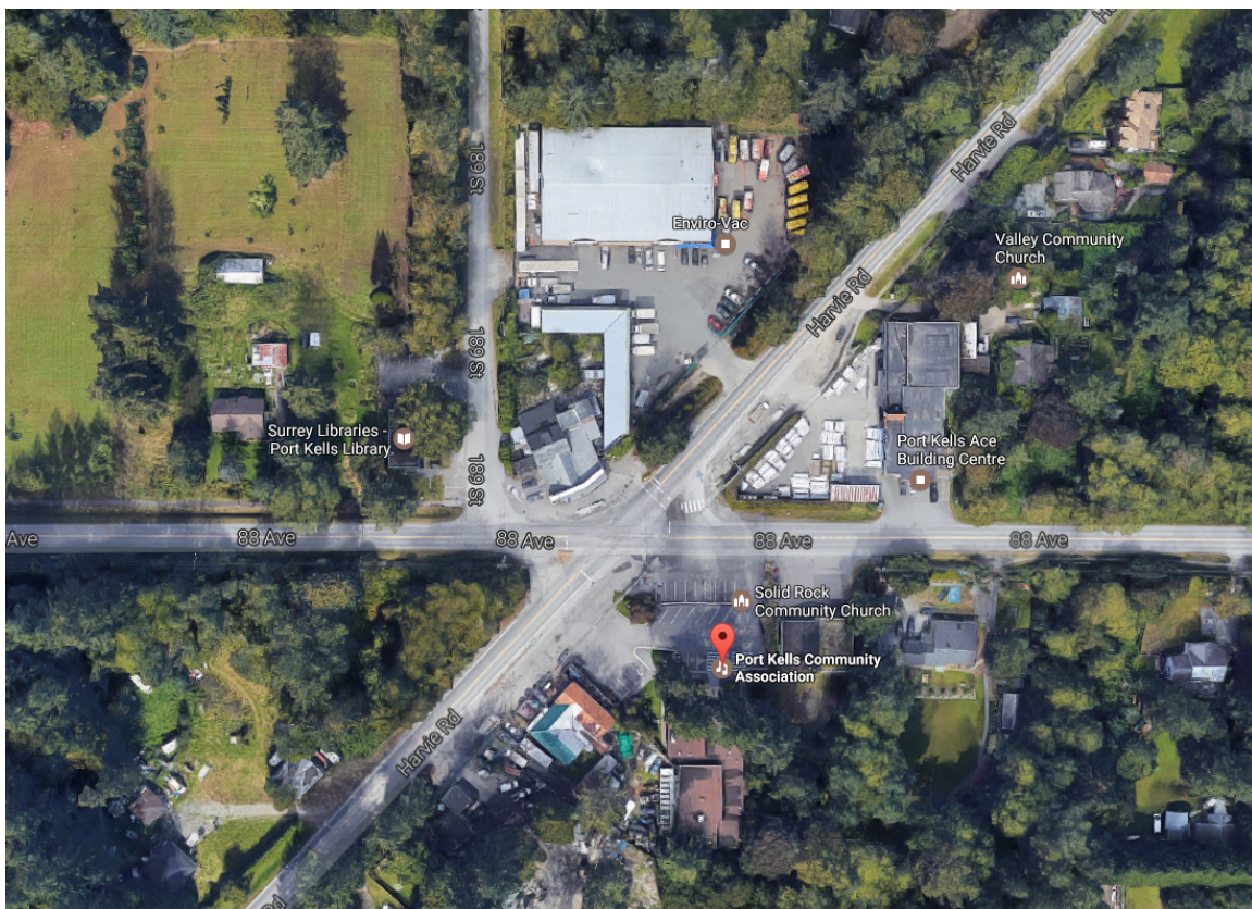
Aerial view of Port Kells Hall and surroundings