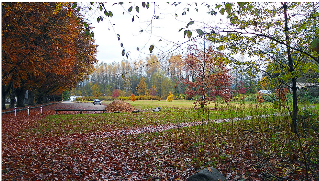
Port Kells Nature Park in the Fall