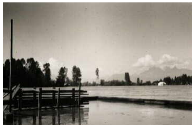
Port Kells wharf during Fraser River flooding of 1948