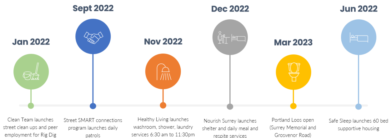
Figure 2. Service Timeline