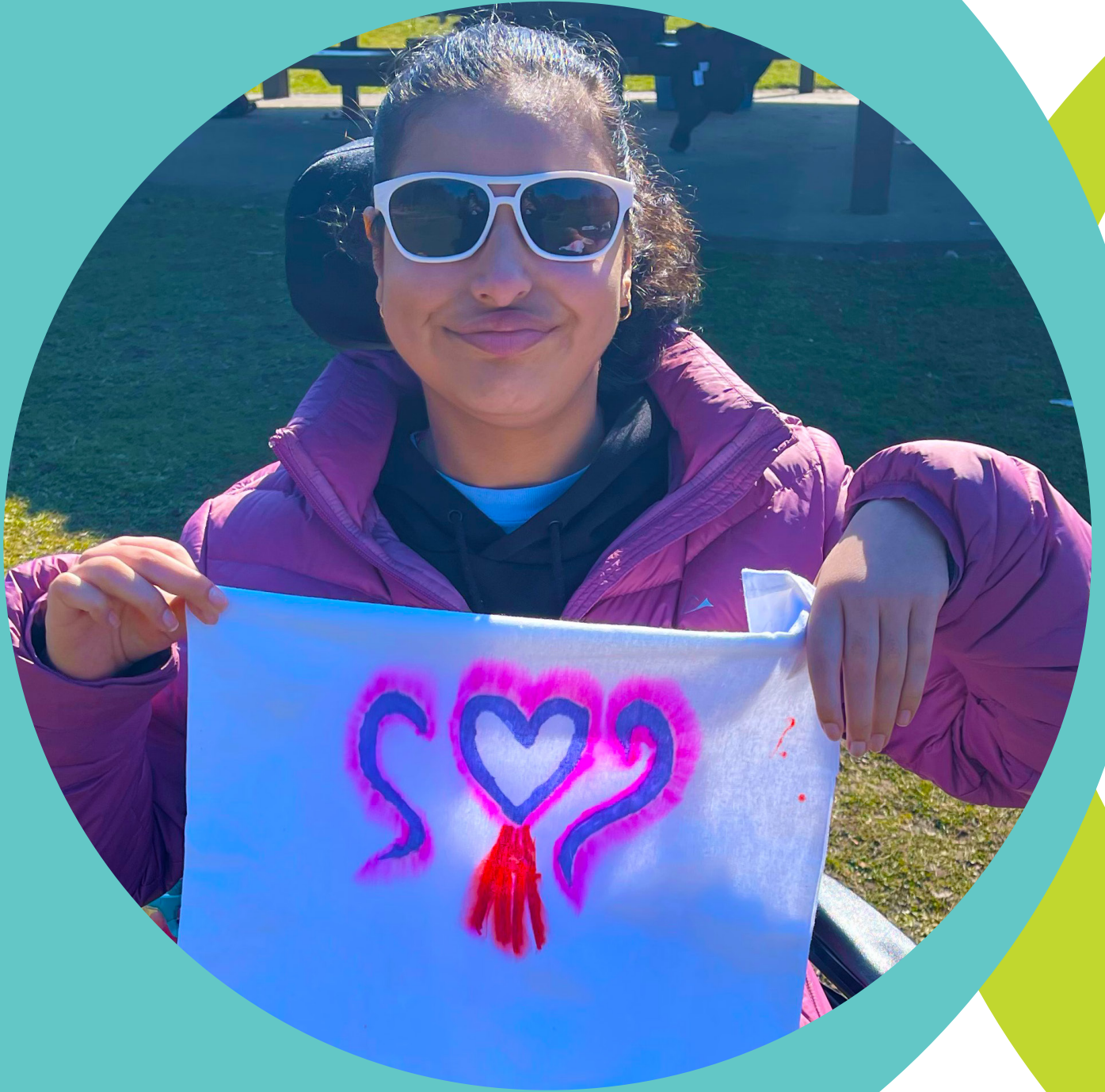
Photo: Youth on the Move Summer Camp Participant