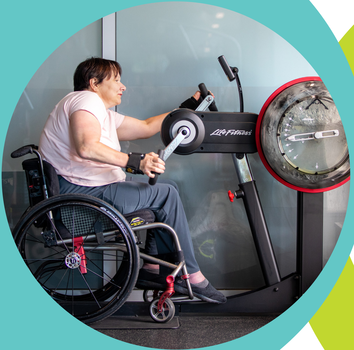
Photo: Surrey Accessibility Leadership Team Member at Newton Recreation Centre using the Upper Cycle Ergometer