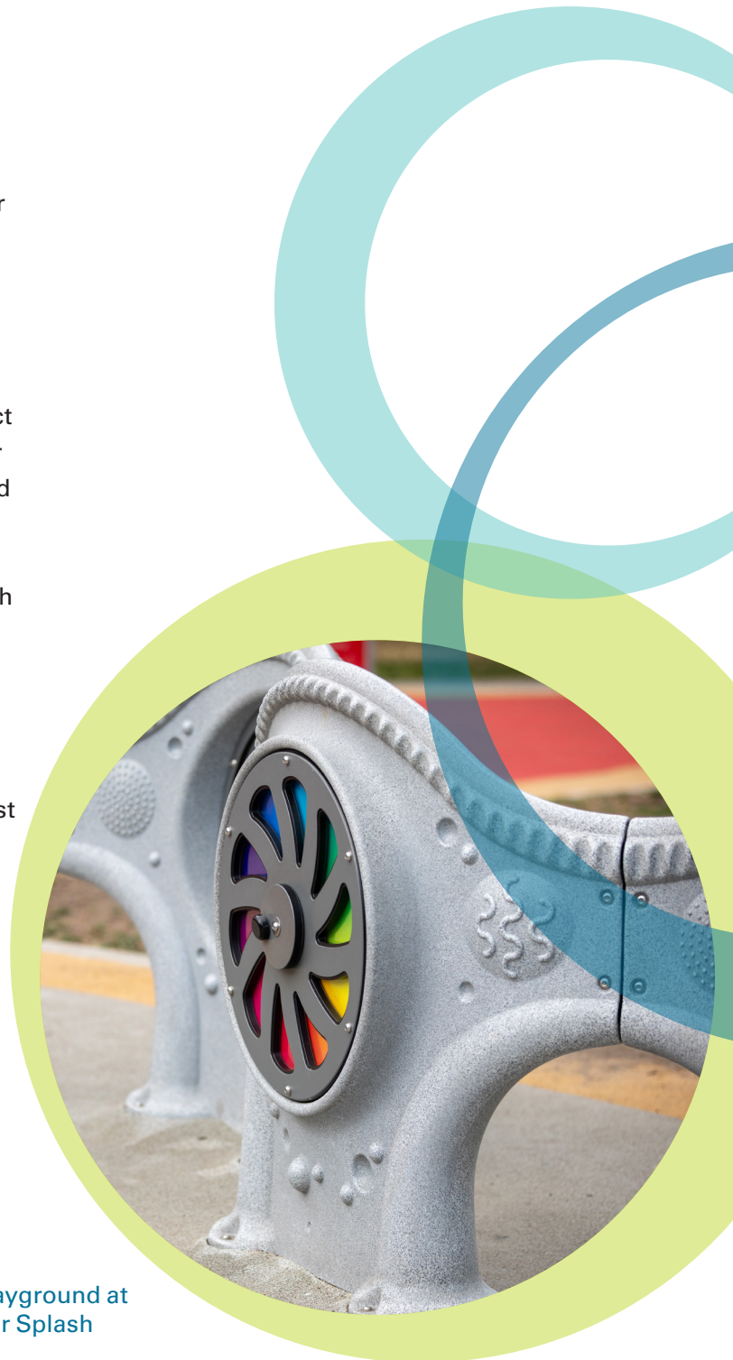
Photo: Inclusive Playground at Unwin Park - Colour Splash Sensory Play

The City of Surrey values the diverse contributions of our aging population. Through respectful community engagement we will collaborate with local organizations, levels of government, business, and most of all with seniors' groups and individuals to ensure seniors and their families have access to the resources and programs which support healthy active aging.