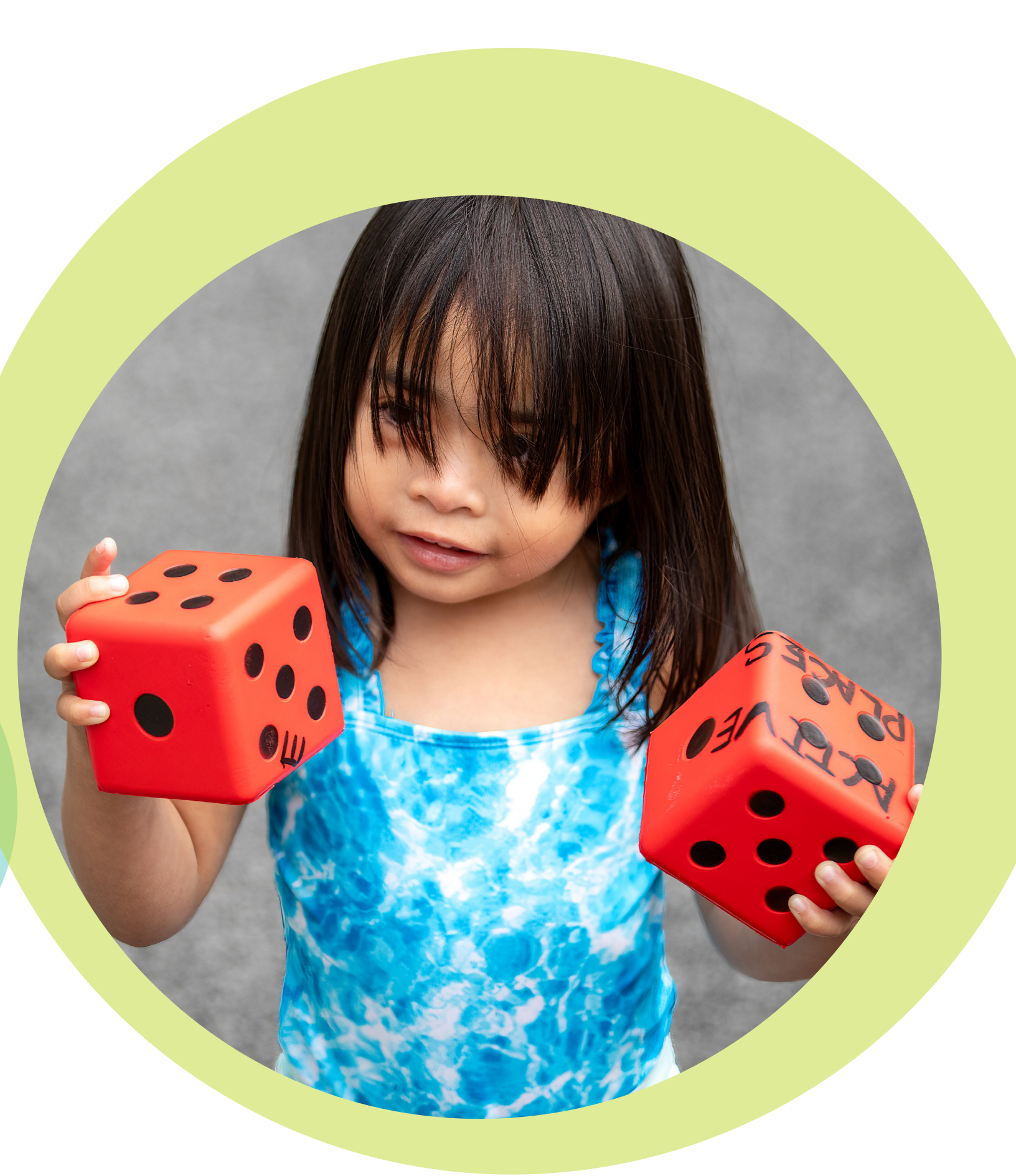
Photo: Child playing at the Inclusive Playground at Unwin Park