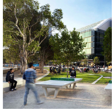
A PING PONG