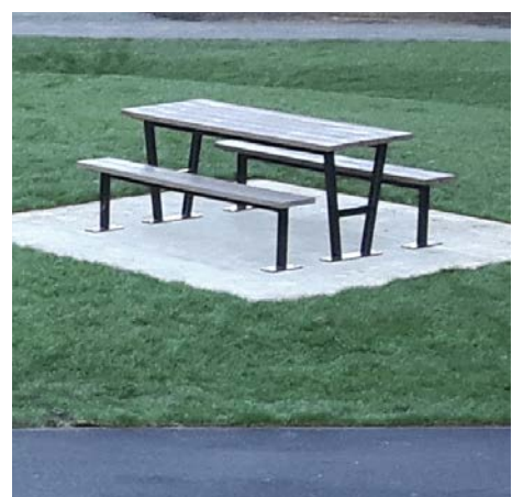
G PICNIC / BENCH