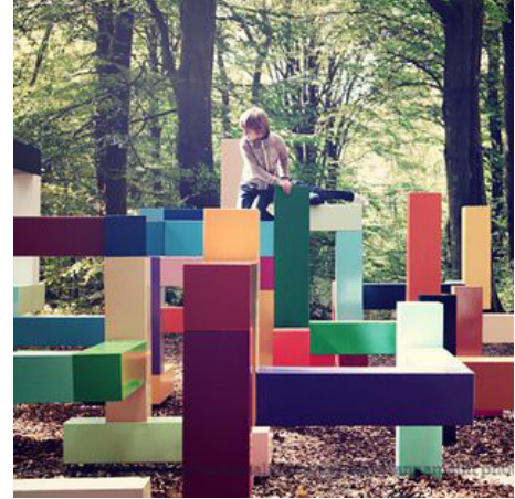
B WOOD CLIMBER/ PARKOUR ELEMENTS