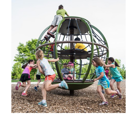
I LARGE SPINNER