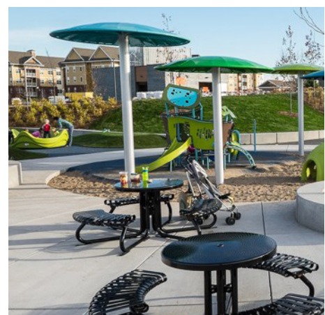
D SAND PLAY