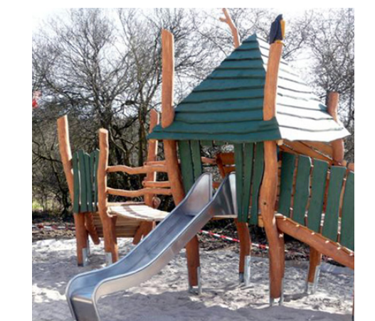
K TOT HOUSE