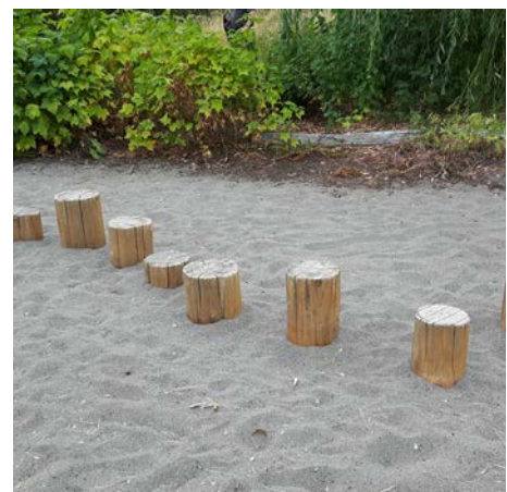
C LOG STEPPERS