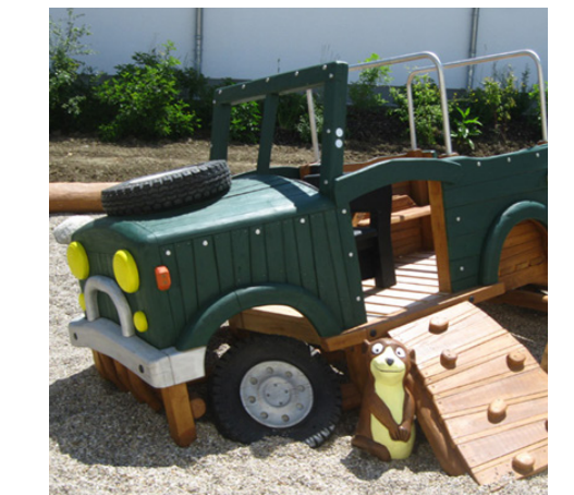
H DUNE BUGGY