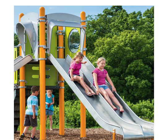
L YOUTH STRUCTURE