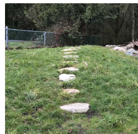
E EARTH BERM