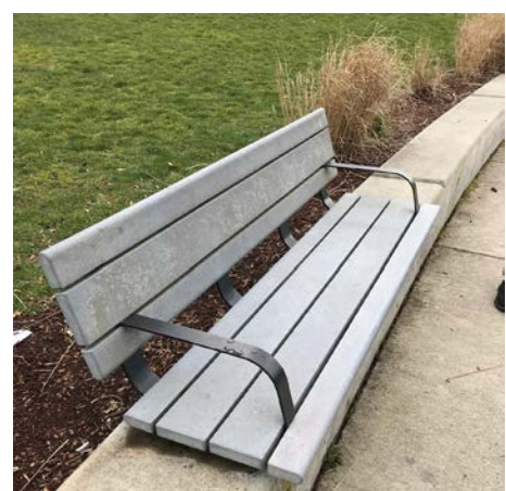
F FORMAL SEATING