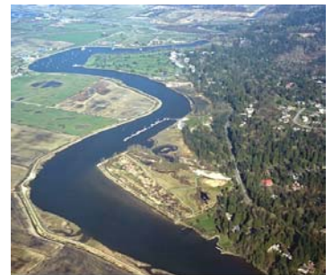
020 - Elgin Heritage Park