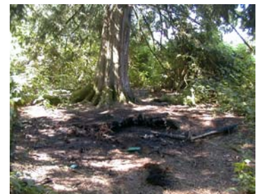
Illegal fire pit

In Surrey, of greatest concern is the large percentage of fires that are deliberately set in close proximity to facilities and structures adjacent to