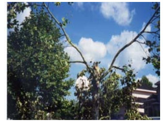
Tree failure due to poor structure

The primary strategic direction for managing tree hazards, is to provide for safe use, reduced corporate liability and increased benefits to natural area ecosystems.