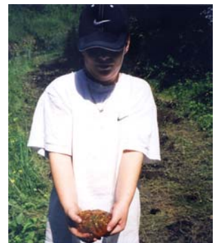
Relocating salamander eggs

The primary strategic direction for fauna management is to acquire habitats and manage natural areas to ensure the long-term viability and diversity of global, regional and local faunal resources. This includes the protection, enhancement and restoration of a range of species and habitats for fish, wildlife, and other fauna.