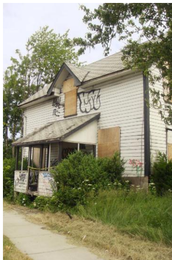
Photo 1: Front Elevation (south) showing cross gable dormer; entrance porch with shed roof; whalebone bargeboards; closed soffits and corner boards

The following photos depict the existing appearance of the George E. Lawrence House: