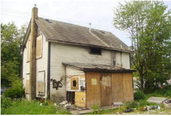
Photo 2: Rear Elevation (north) showing extensive fire damage; and enclosed shed roof addition