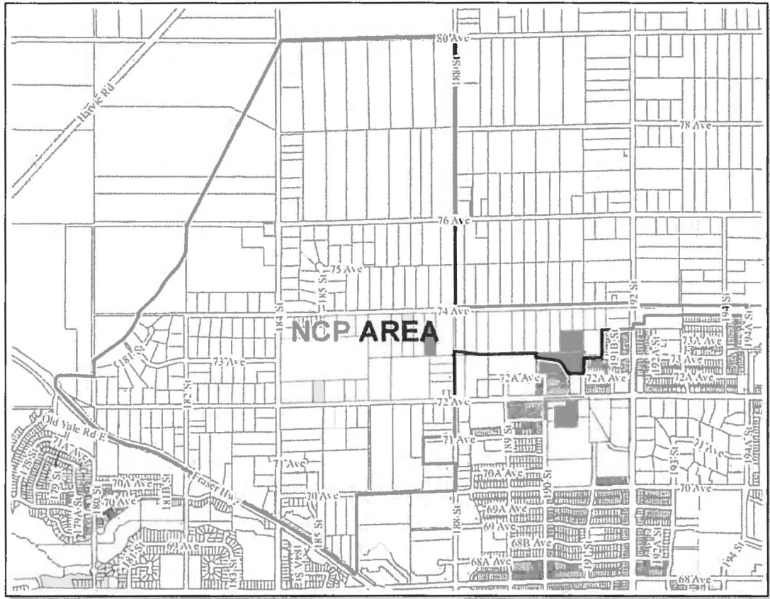
MAP NO. 14 WEST CLAYTON NEIGHBOURHOOD CONCEPT PLAN LANDS SUBJECT TO SURCHARGE