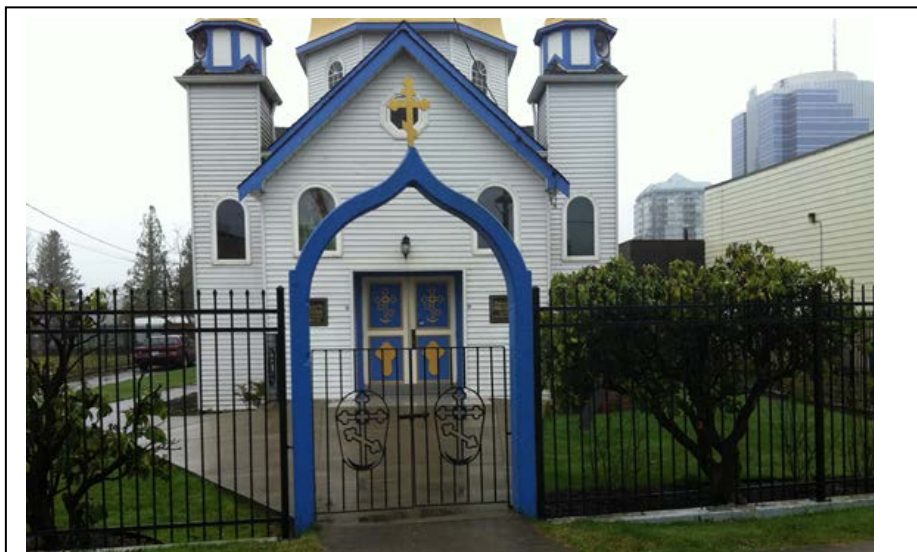
Fence will match new fencing at the adjacent Ukrainian Church.