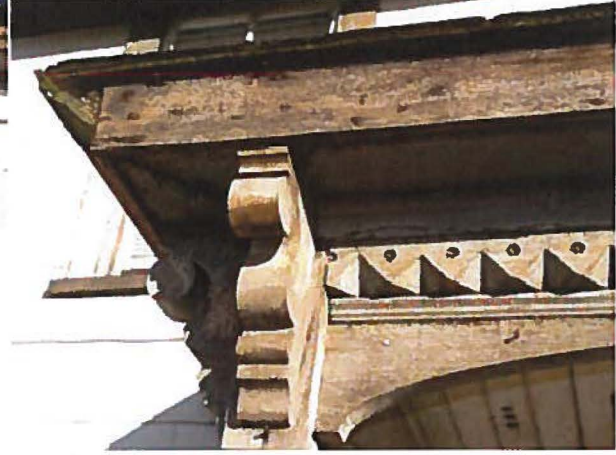
Closer detail of bracket

The following depicts some of the details of the Milk Cooling Shed: