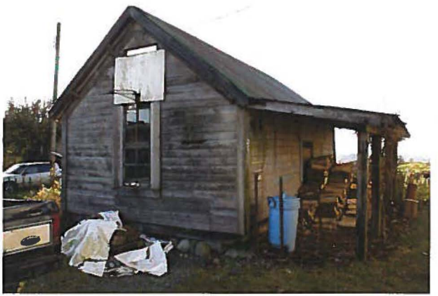
East and north elevations