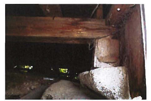
Boulder footing, post and sill beam