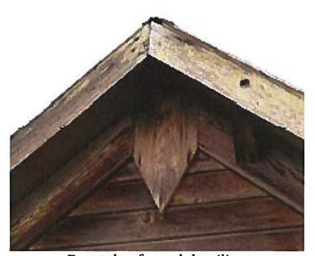
Example of wood detailing