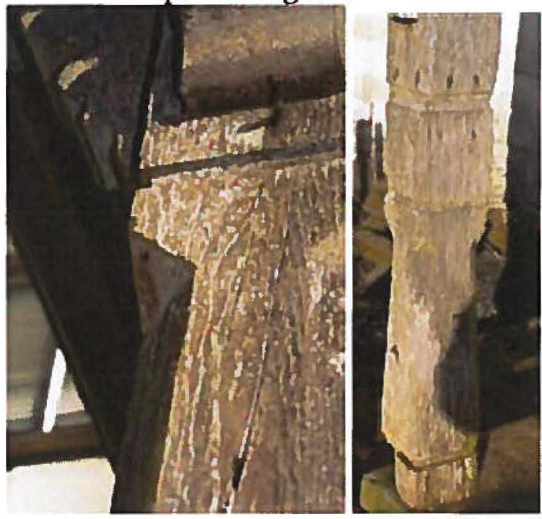
Detail of porch column and console