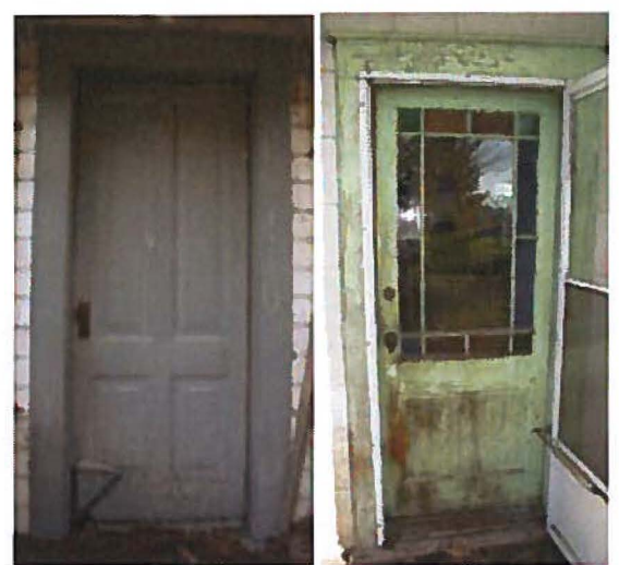
Example of original doors