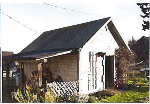
West and north elevations