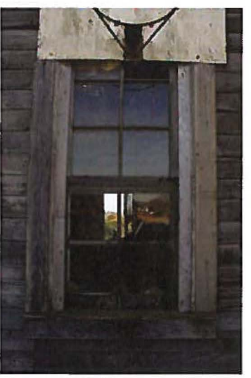
Example of wood window