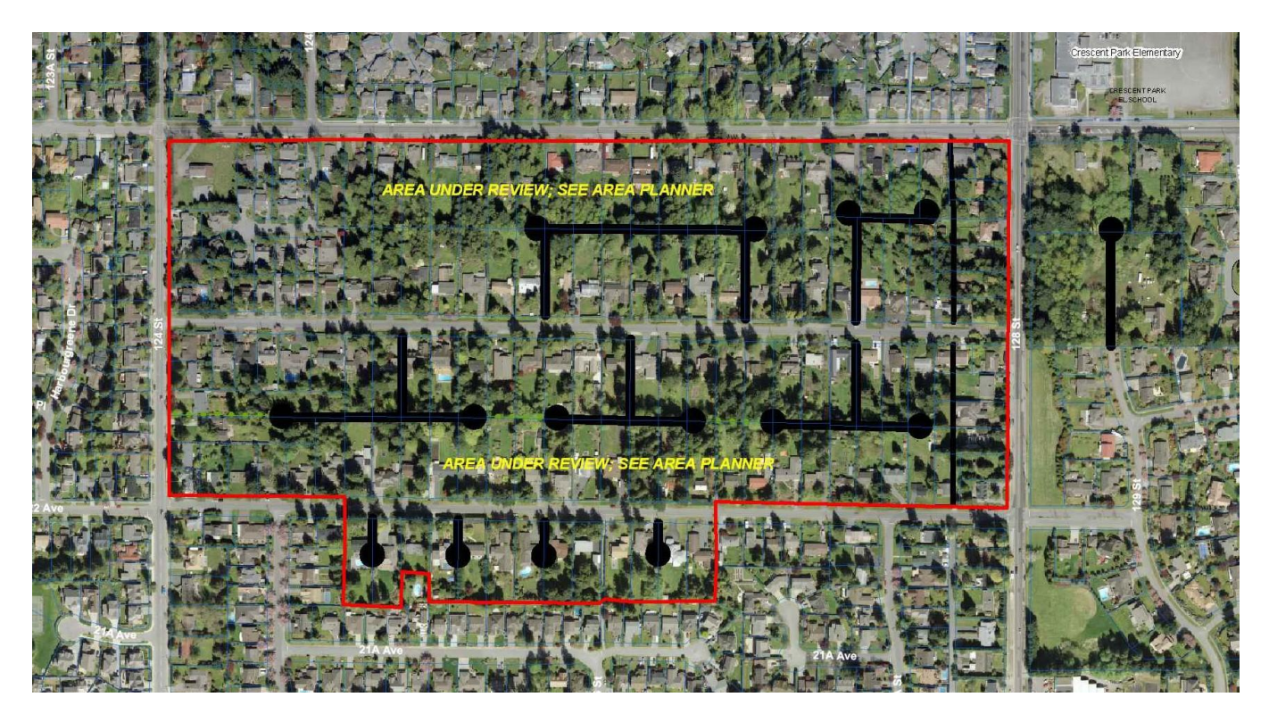
Crescent Park Annex Area – Road Pattern (Area Concept Plan)