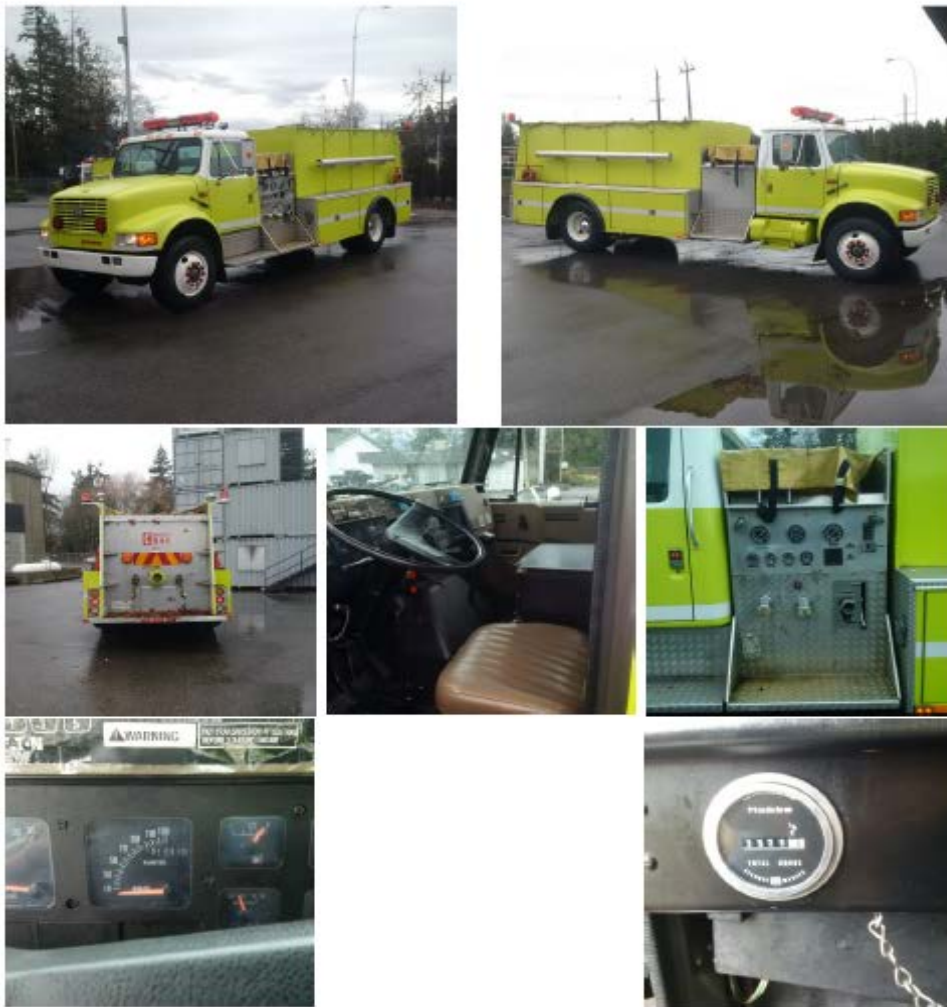
1991 Water Tender for Sale