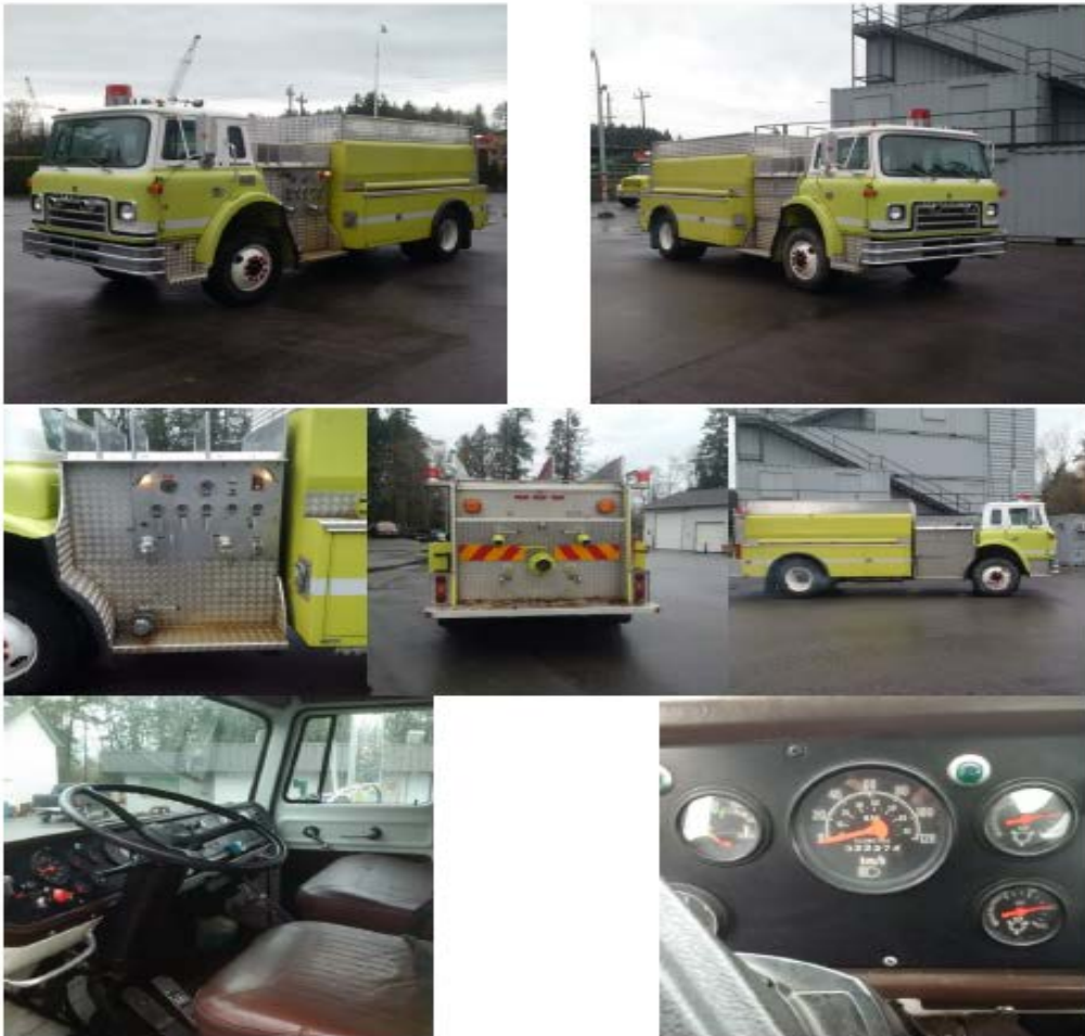
Water Tender for Sale