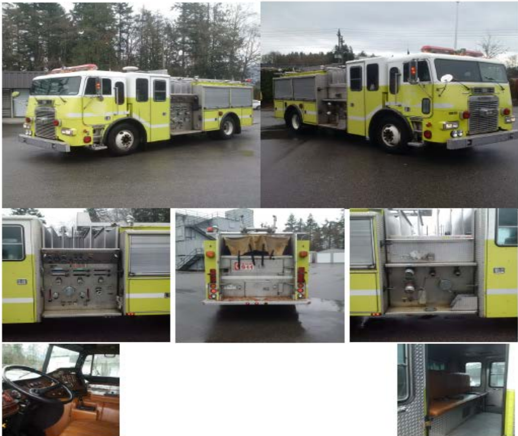
1995 Pumper Fire Apparatus for Sale