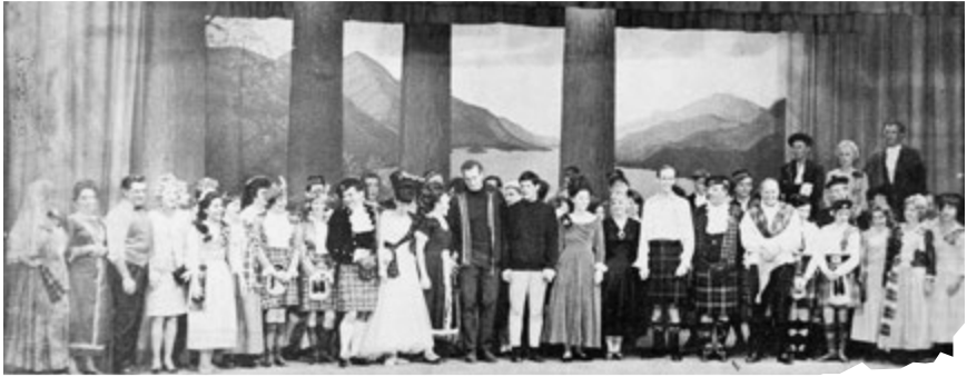
The whole cast of Brigadoon takes a final curtain call following the first night of the production at the new Surrey Centennial Arts Centre and Theatre.