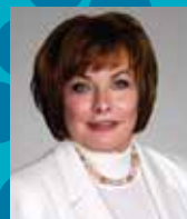
MAYOR LINDA HEPNER