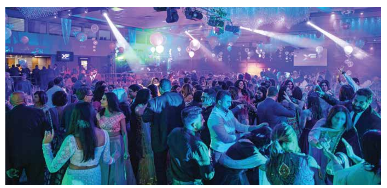
SPONSORSHIP OPPORTUNITIES AVAILABLE FOR 2023