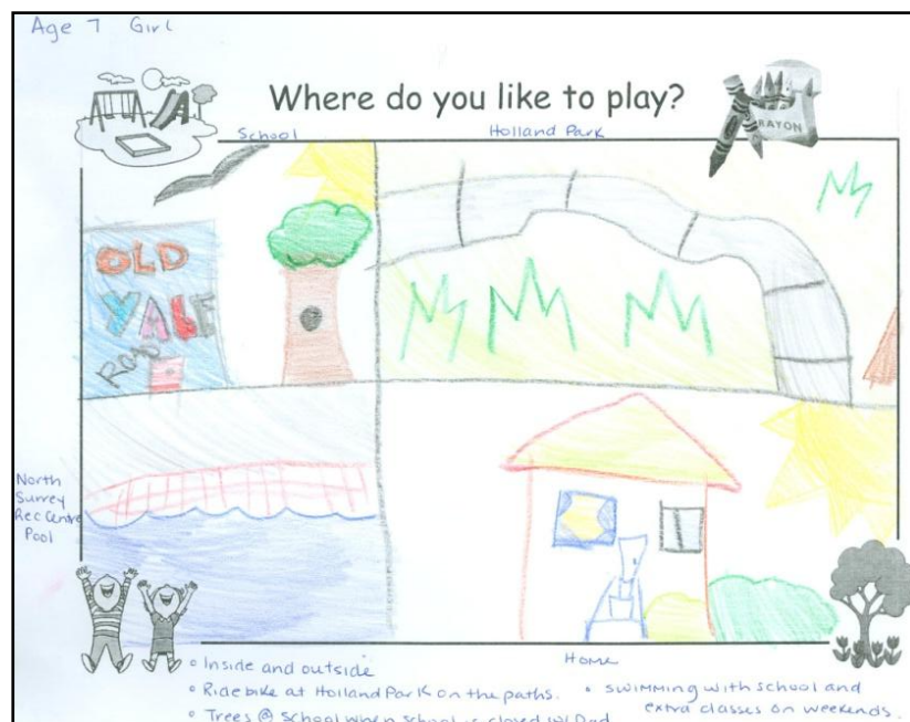
Children find places to play all over the City.