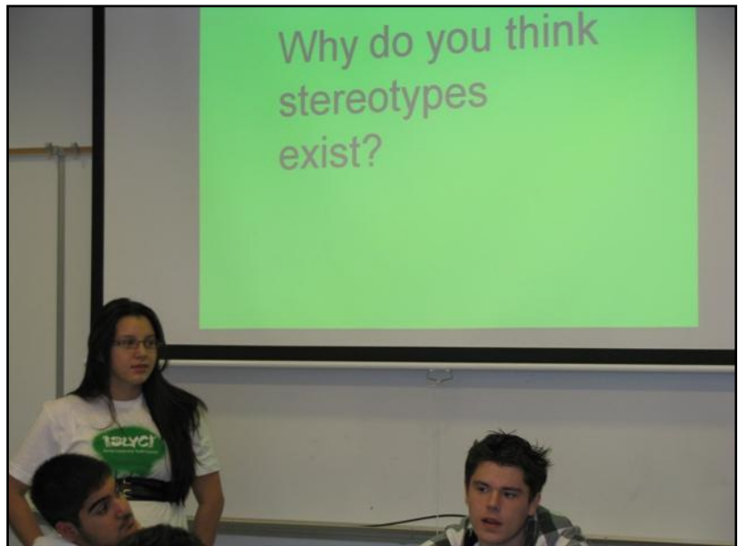
Youth engaging other youth in dialogue on issues important to them.