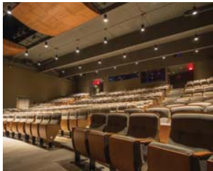
Assembly occupancies, including halls, churches, restaurants & pubs

Handouts for each occupancy can be downloaded from the Fire Inspection Guidelines section at www.surrey.ca/fireservice .