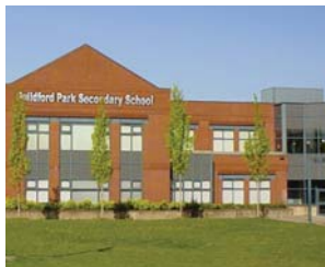
Schools & educational facilities