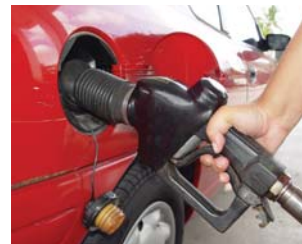
Service stations, including gas stations & automotive repair shops