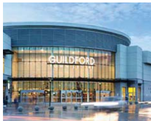
Retail & commercial