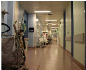
Hospitals & health care facilities