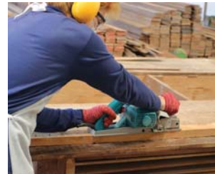
Manufacturers, woodworking shops & spray operations