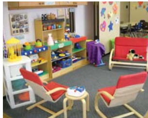
Daycares & preschools