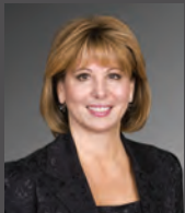
MAYOR DIANNE WATTS