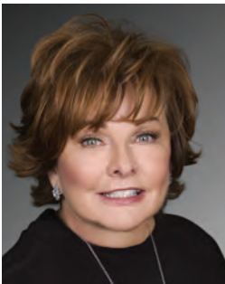
Mayor Dianne Watts

A handwritten signature in black ink, appearing to read 'Dianne Watts'.