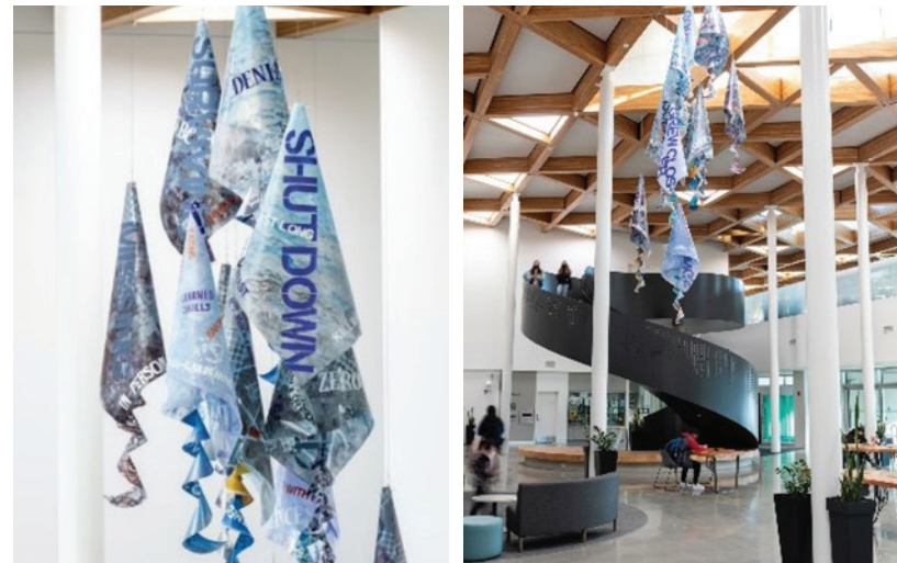
Jude Campbell – Covid Reflections (2021)