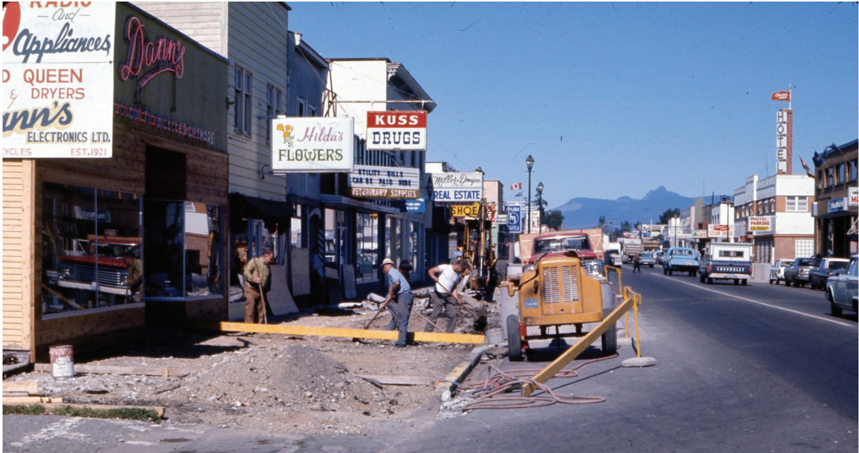
Urban planning and urban renewal efforts transformed the landscape of Surrey in the 1960s and '70s. Pictured above is the revitalization of 176th Street in Cloverdale's historic downtown in 1971.