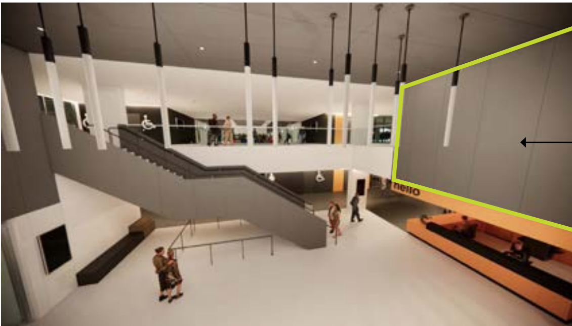
View of Lobby